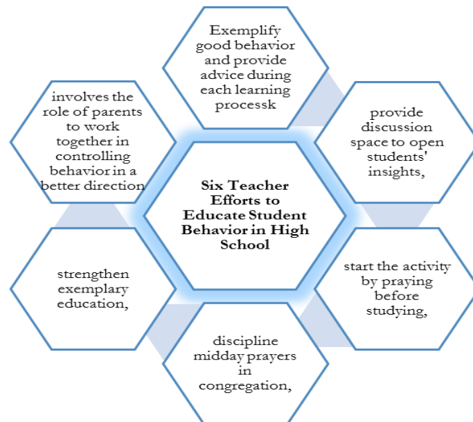
Fig 2. Six efforts by teachers to educate student behavior in high school

Based on the results of the author's interviews with thirty-six people, consisting of twenty-six students, one principal, one student representative, one curriculum representative, three Islamic Religious Education teachers, and five parents of high school students, the results of the analysis found that there were six efforts by Islamic religious education teachers to develop students' morals, these six development efforts can be seen in figure 2.